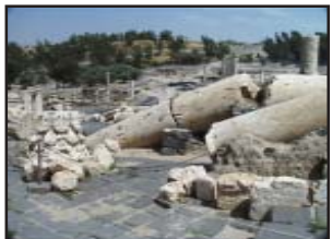
The ruins of Beit Shean.

* These areas include what is known as the West Bank. Whether or not we can actually go there will depend on the political situation at that time. If we cannot go, only two-and-a-half days of the tour will be affected.