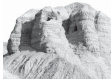
The caves at Qumran.