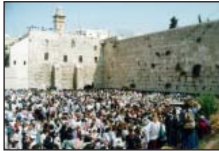
The Western (Wailing) Wall of the Temple Mount.

Tour participants should always keep the tour goals (see front page) in mind and prepare accordingly. Setting different, personal, goals and expectations will only cause disappointment and adversely affect the group. If you cannot agree to these goals, then it would be wise to choose another tour. Participants must be at least 18 years old; children are not permitted to attend. Couples need to make certain that both partners are totally interested in a study-tour of this nature. Only those who are truly committed to such a trip should apply. Those with serious health problems (i.e. heart trouble, kidney disease, etc.) should not attempt this kind of trip. If you are taking medication, be sure to bring enough for the duration of the tour.