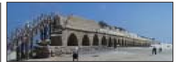
The aqueduct at Cesarea by the sea.