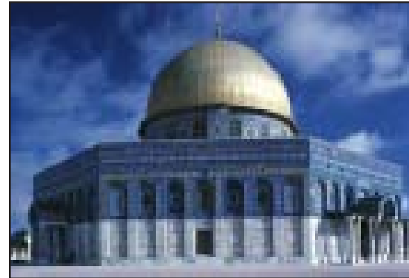
The Dome of the Rock on the Temple Mount.